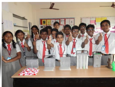
The Production team members expressing their victory & are ready to receive more orders