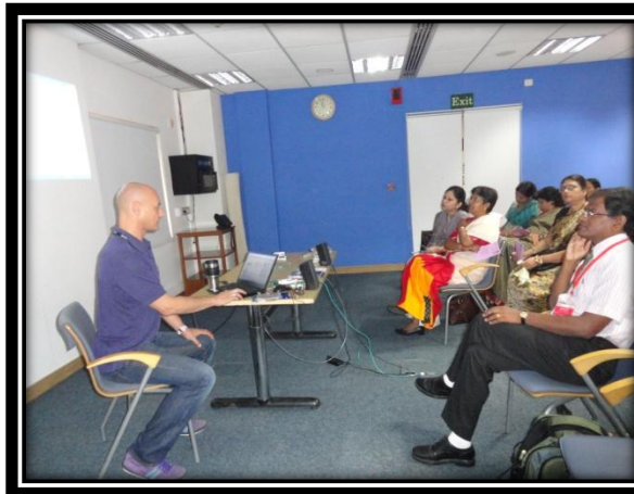
Training Session @ British Council