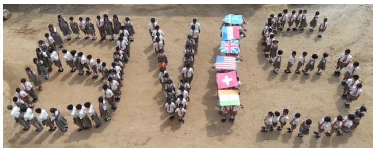
School Enterprise Challenge's runner up photograph voted on the net worldwide